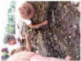
Wet Site Excavations, Thurston County