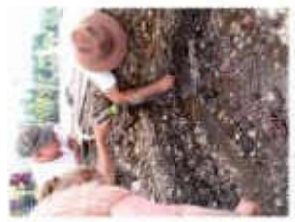
Wet Site Excavations, Thurston County