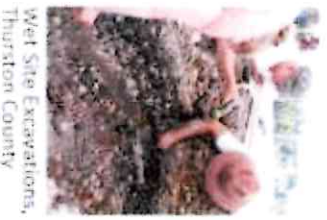
Wet Site Excavations, Thurston County