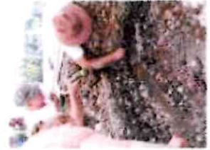
Wet Site Excavations, Thurston County