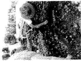
Wet Site Excavations, Thurston County