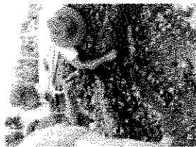
Wet Site Excavations, Thurston County