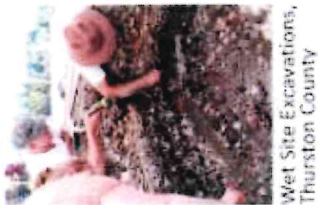
Wet Site Excavations, Thurston County