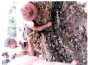
Wet Site Excavations, Thurston County